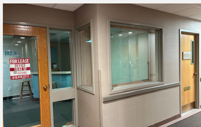
Lobby Suite 102 - 1,843 SF