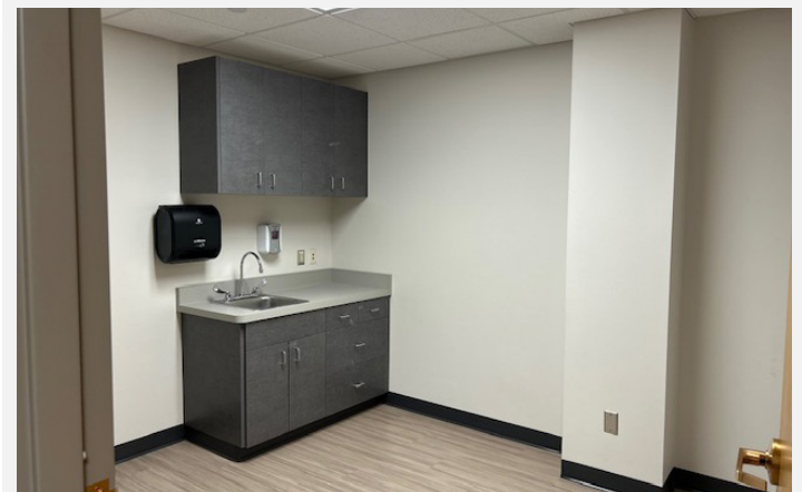
Suite 216 – 1,145 SF