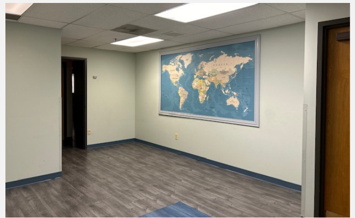
Suite 210 – 3,856 SF