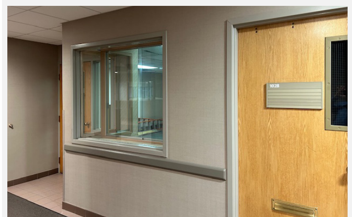
Lobby Suite 102 - 1,843 SF