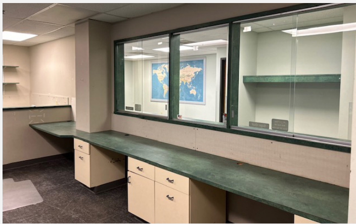
Suite 210 – 3,856 SF